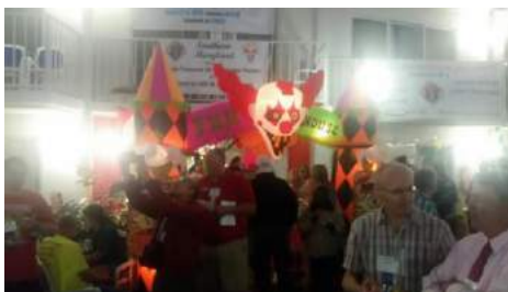
Left: after the opening session was over the Hospitality Rooms in the Atrium were open for fun and relaxation. The Hospitality Rooms are judged every year and District 21 was planning on being in the running this year.

My best game was the Corn Hole. No pictures but I was the first Grand Knight to get five out of five bean bags into the hole. Where was the camera when you really needed a picture – Suzanne was out shopping the outlets. Later after the GK Olympics we gathered for a Mass and the Opening Session of the Convention at 7:00 pm. No cameras allowed.