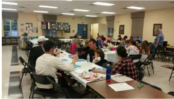
KofC Gift Card Bingo, players asked when our Bingo would be back!