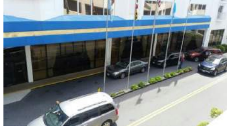
Left: Princess Royal Hotel as seen from the parking garage.