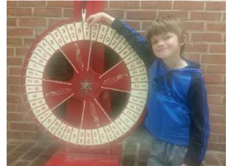
Spinning the Lucky 45 Money wheel.