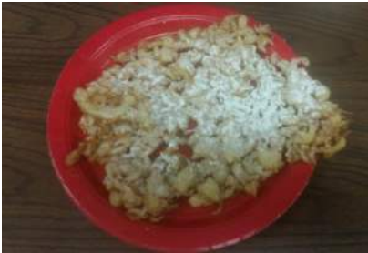
KofC Signature Funnel Cake, MMM, mmm good.

Back by Popular Demand, oh yeah, spell that P-O-P-U-L-A-R demand. Well what was our Council to do? The West Room had an opening in April after Easter, so let's do it again Brothers. This is a Family Social for the Brothers, the parish community, and their families to come together and have a good time at a family price. The food was prepared by the Knights and was a welcome treat for our guest. After the evening was over we were all considered hero's by those in attendance for a job well done.