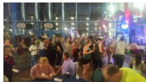
There was music & dancing if you were so inclined.