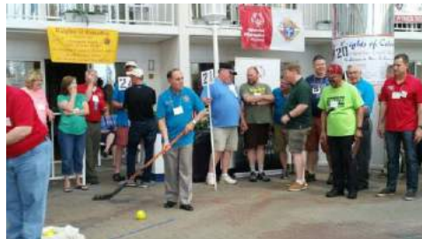
Another game we played was hockey. We all got 3 ‘pucks’ (actually tennis balls) to slap shot into the net. I was a lot luckier at this game I got all three balls into the net. Hey!