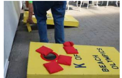
In case you don't know what that corn hole game is anymore here is a picture.

My best game was the Corn Hole. No pictures but I was the first Grand Knight to get five out of five bean bags into the hole. Where was the camera when you really needed a picture – Suzanne was out shopping the outlets. Later after the GK Olympics we gathered for a Mass and the Opening Session of the Convention at 7:00 pm. No cameras allowed.